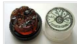
A cake of rosin, made for use by violinists, used here for soldering