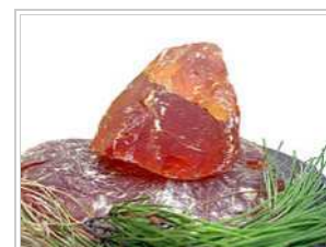
Colophony or Rosin from the Maritime Pine

The main source of supply in Europe is the French district of Landes in the departments of Gironde and Landes, where the Maritime Pine P. pinaster is extensively cultivated. In the north of Europe rosin is obtained from the Scots Pine P. sylvestris , and throughout European countries local supplies are obtained from other species of pine, with Aleppo Pine P. halepensis being particularly important in the Mediterranean region.