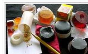
Various types of rosin for violins, violas and cellos

Rosin is the resinous constituent of the oleo-resin exuded by various species of pine, known in commerce as crude turpentine. The separation of the oleo-resin into the essential oil (spirit of turpentine) and common rosin is accomplished by distillation in large copper stills. The essential oil is carried off at a temperature of between 100° and 160 °C, leaving fluid rosin, which is run off through a tap at the bottom of the still, and purified by passing through straining wadding. Rosin varies in color, according to the age of the tree from which the turpentine is drawn and the degree of heat applied in distillation, from an opaque, almost pitch-black substance through grades of brown and yellow to an almost perfectly transparent colorless glassy mass. The commercial grades are numerous, ranging by letters from A, the darkest, to N, extra pale, superior to which are W, window glass, and WW, water white varieties, the latter having about three times the value of the common qualities.